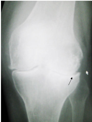
X-Ray evidence of osteoarthritis in the knee

tivate the elevated levels of catabolic agents found in OA subjects. Adding exogenous A2M did precisely that.