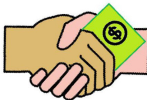
Wikimedia Commons and Herostratus