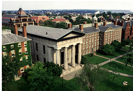
Brown University Campus