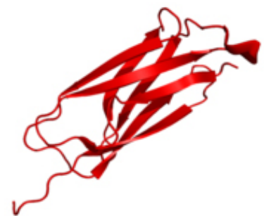
Crystal Structure, A2M Monomer/Source: Protein Data Bank 2P9R

is that A2M is also a powerful protease inhibitor. And, as the researchers learned when they tested it, it can inhibit a broad spectrum of catabolic proteases. And what, you might ask, is the point of that? The point is that it could well be highly effective in treating one of the most pervasive and resistant chronic diseases—osteoarthritis.