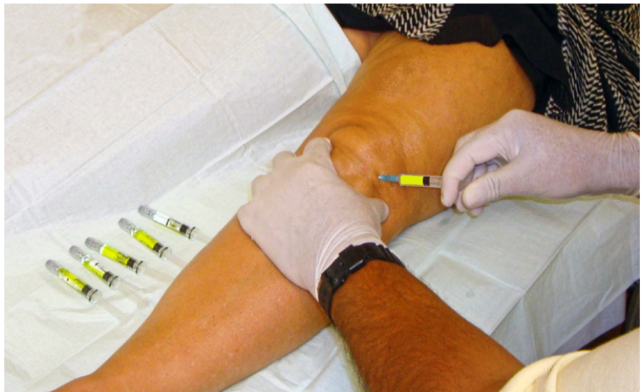
Wikimedia Commons and Harry Gouvas

In January 2014 Blue Cross Blue Shield of Massachusetts announced that effective July 1, it would no longer reimburse for certain viscosupplementation products and cited the revised AAOS clinical practice guidelines. Other payers have followed suit.